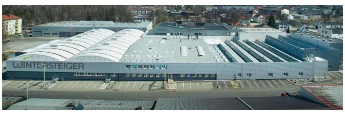
Headquarters located in Ried im Innkreis, Upper Austria