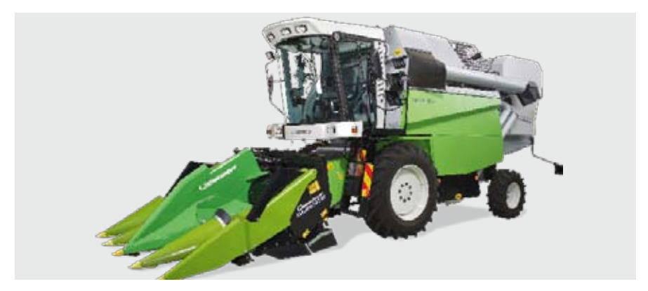
Plot combine Split

Laboratory thresher, laboratory corn sheller, seed dresser, sample chopper and sample divider