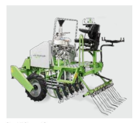
Plot drill Plotseed S