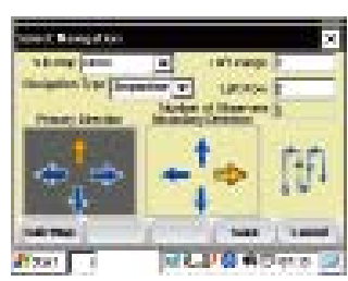
Start by defining field navigation, that is, the move direction or shape

The FRS note taking module is used to record observations in field trial plots.