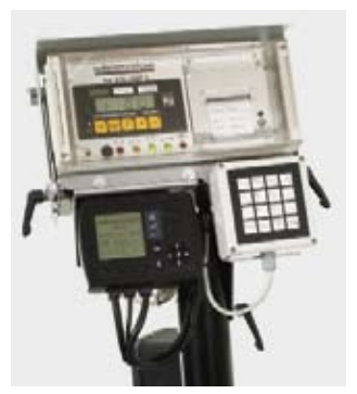
DK 800 data collection system