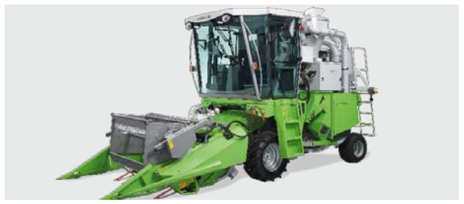
Plot combine Delta

As complete provider in agricultural testing, WINTERSTEIGER proves itself as strong partner for customers in various fields: