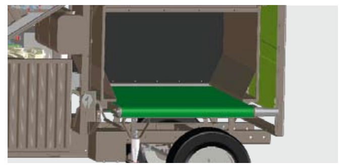
Mobile harvest data system Generic Harvest Module™

We reserve the right to make technical alterations