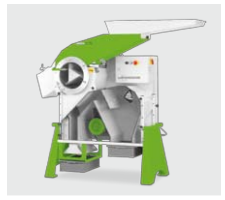
Laboratory thresher LD 350